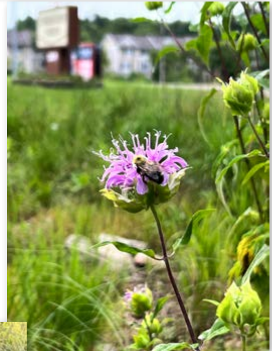
Right: Bees also enjoy Monarda, commonly called Bee Balm.