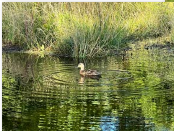
Left: Rainwater on the west end of the lawn provides a nice swimming pond for visitors.