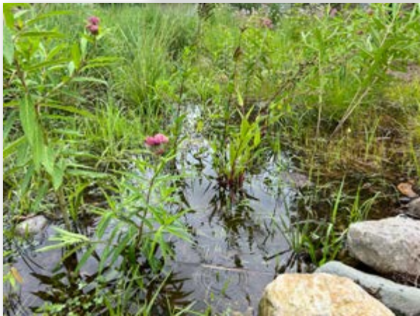
Left: Milkweed and grasses help soak up the excess rainwater.