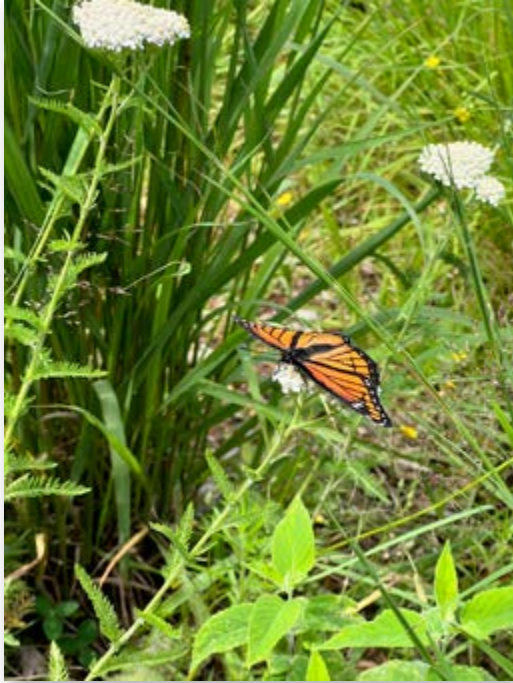
A monarch sips nectar from Wild Quinine (left) and Monarda (right).

The CoM rain garden is flourishing with Michigan native plants and is loved by all kinds of pollinators! Here are a few photos from this season. More plants and shrubs will be added this fall and in successive years but the garden is doing its job in helping hold and filter rainwater from the parking lot and roof, and providing vital food for pollinators.