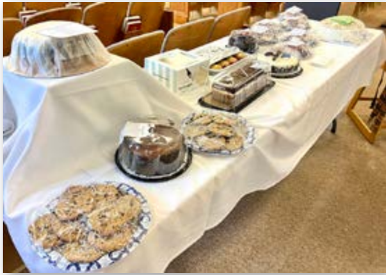
Cake walk prizes waiting to be claimed