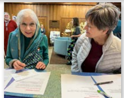
Postcard signing and crafts!