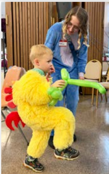
CoM and TBI members join together for a morning of Purim hijinks.