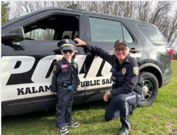
The Purim Carnival security team